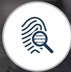
FINGERPRINT/ FACE RECOGNITION READER