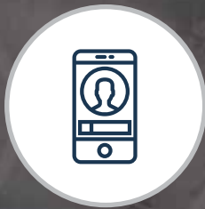
FACE RECOGNITION APP & STAFF SELF SERVICE