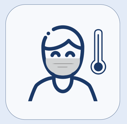
Temperature & Mask Detection

Compatible with SafeEntry Contact Tracing